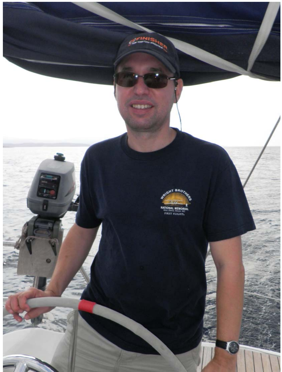
Vor lauter Steuerleute - keine Matrosen !